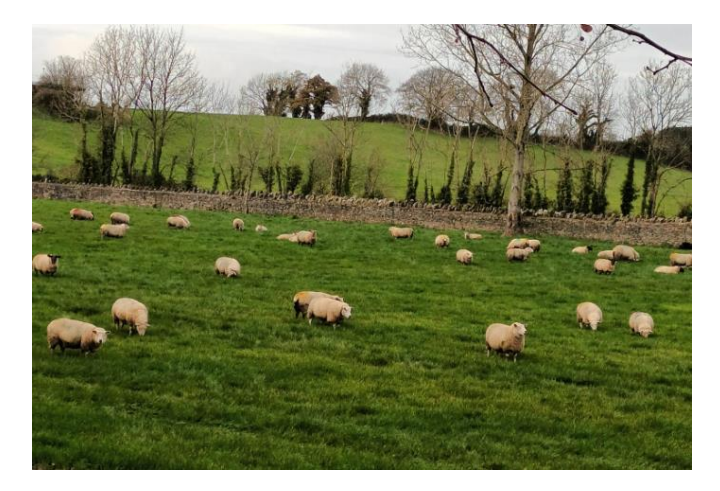
Student Visits & College Activities

The last 10 store lambs and six cull ewes were sold at Ennis mart on Monday. Lambs averaged 38 Kgs and sold for \notin 122 each. The 6 cull ewes averaged 78 Kgs and made \notin 133 each. Two Texel rams, which were suitable for breeding, were also sold on the day and made \notin 148 each. Breeding in the ewe flock finished on Friday and all ewes will be housed for the winter in the coming days.